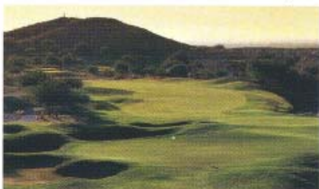
The Foothills Golf Club Pg. 19