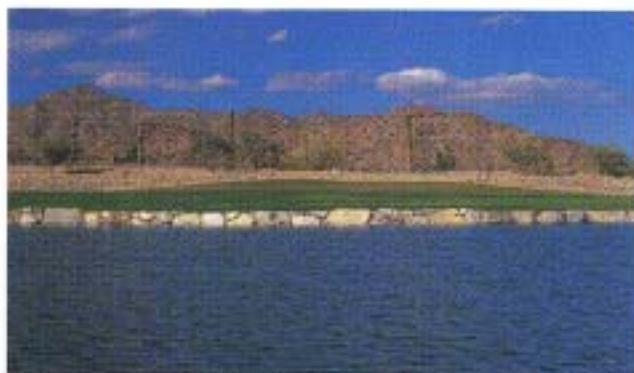
The Raven Club at Verrado Pg. 6

A comprehensive listing and corresponding maps of the locations of the area's accessible golf facilities, our featured courses and accommodations.