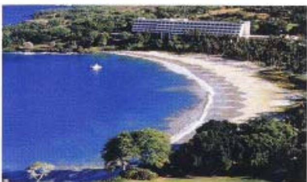
Travel Directory Pg. 57

ABOUT THE COVER: The 16th at The Raven Golf Club at Verrado.